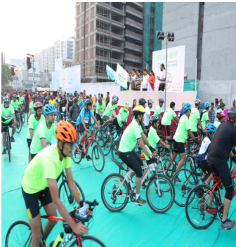
IT'S A COMMUNITY WELFARE NGO